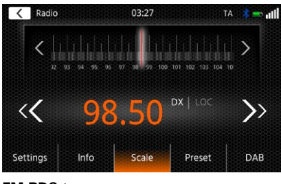
FM RDS tuner

The X-F275 supports Apple CarPlay, a smarter, safer and more entertaining way to use an iPhone in the car. With CarPlay, you can make phone calls, navigate, listen to music and control all supported functions via Siri voice control or the large display.